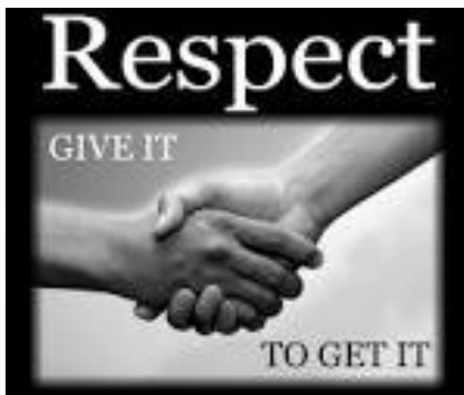
Respect cards. Can you get one?

Is there anything you would like advertised?