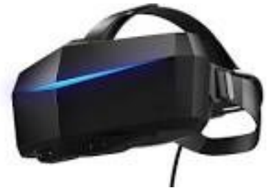
Digital leaders year 6 Tuesday lunch times.