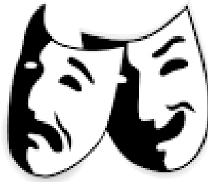
Drama Wednesday after school