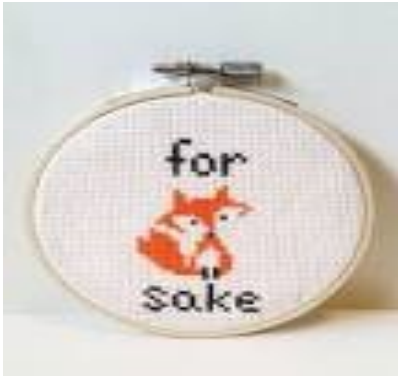
Cross stich club after school Thursdays!