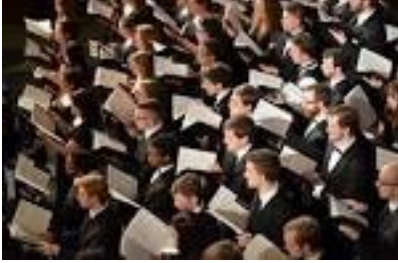
Choir Friday lunches