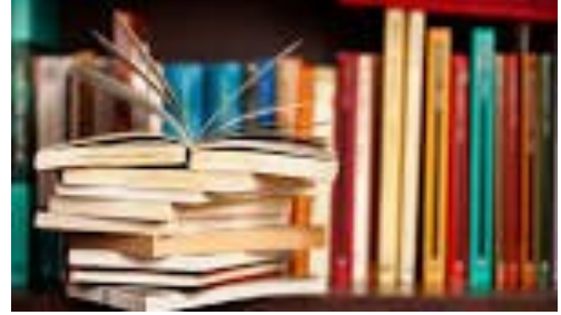
Library all lunches (except Wednesdays)